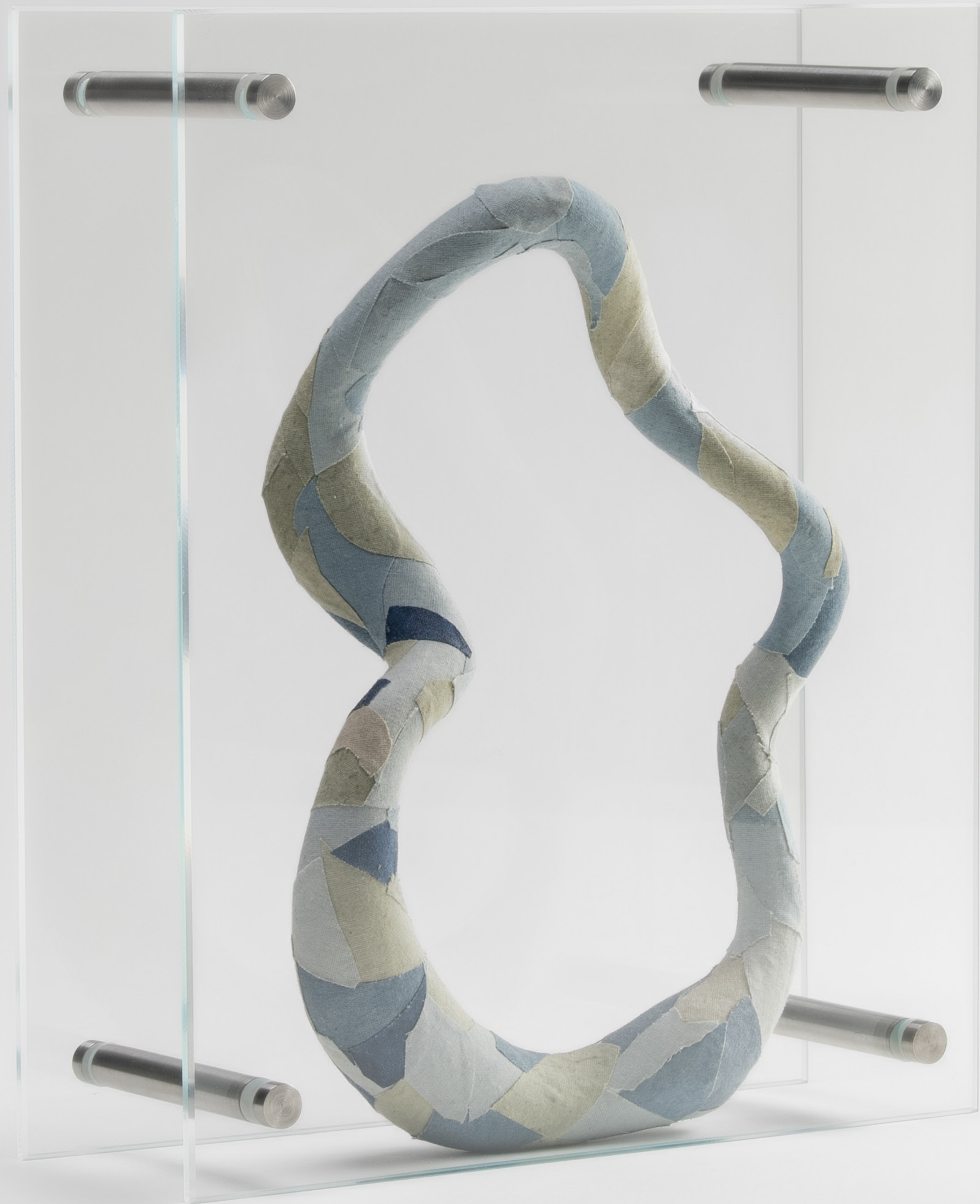
Fabric on Papier-Mâché .10" x 12" . Rs 39000 Original artwork. Includes Glass Panel enclosure on front and back.