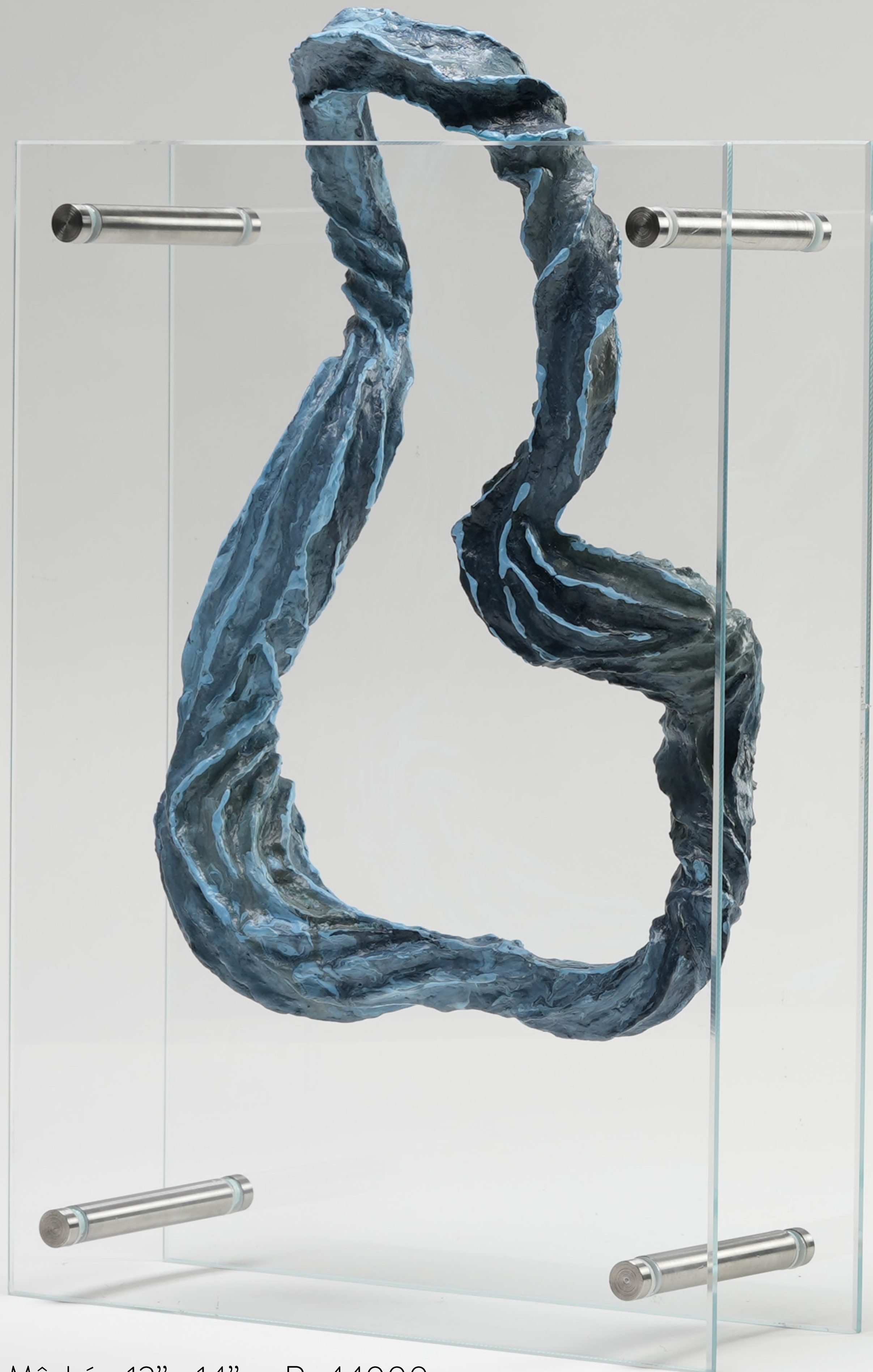
Papier-Mâché . 12" x 14" . Rs 44000 Original artwork. Includes Glass Panel enclosure on front and back.